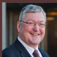
Fergus Ewing Cabinet Secretary for Rural Affairs and Connectivity